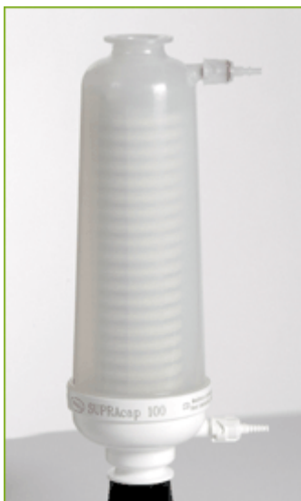
Supracap™ 100 Depth Filter Capsules